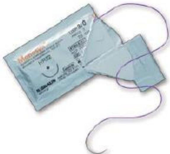
Figura 9: Forma de apresentação de Monosyn (embalagem individual de abertura direta)

Modelos com Embalagem de Abertura Direta: