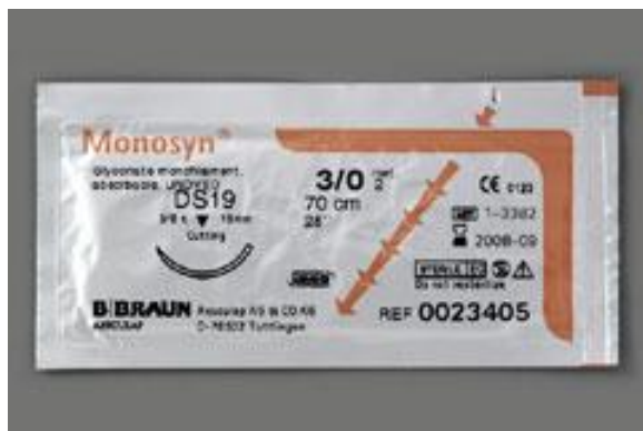
Figura 8: Forma de apresentação de Monosyn (Caixa e embalagem individual de abertura direta)